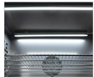
LED strip light accessories