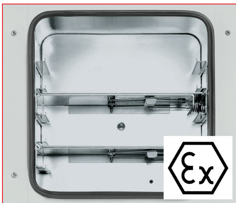
Important Safety Features: Inert gas connection for interior oven flushing. Electronic components are completely separate from interior oven

Safety is guaranteed by the VDL vacuum drying ovens for flammable solvents first and foremost by their explosion-proof interior. Adjustment without overshooting also provides maximum protection for samples, while a unique safety concept is in place where operation is concerned. The design and innovative equipment comply with ATEX II 3G standards.