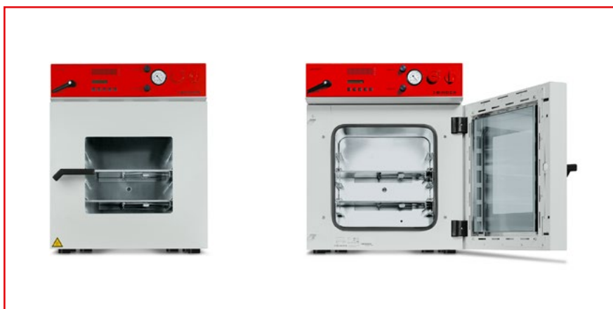
The VD and VDL series from BINDER are suitable for non-flammable materials and materials containing flammable solvents, and they feature a unique safety concept.

We have put together this Buyer's Guide to help you maintain a broad overview while considering all the many different applications. We start by explaining how vacuum drying Ovens work in general and then take a look at the key properties a decent unit will possess, so you know exactly which details you should be looking out for when making your own choice.