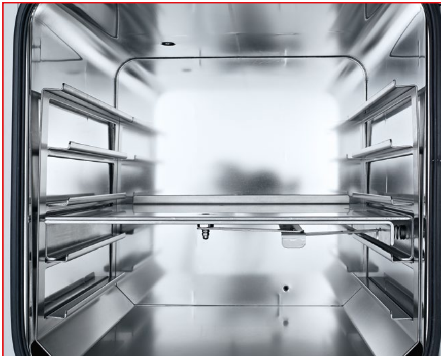
Chrome-plated racks will enable you to dry test specimens homogeneously on several levels.

What this means for you is that first of all you need to consider the size of the test specimen or items to be dried before purchasing your vacuum drying oven. The dimensions of your vacuum drying Oven are of crucial importance and will depend on your requirements.