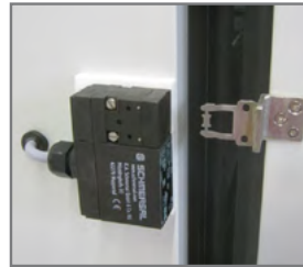
Electromechanical door lock mechanism controlled in a program and/or manually