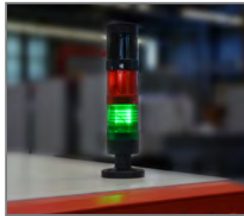
Program sequence display using indicator lamps

BINDER series units are converted by our BINDER INDIVIDUAL department according to special customer requirements, and equipped with additional functions.