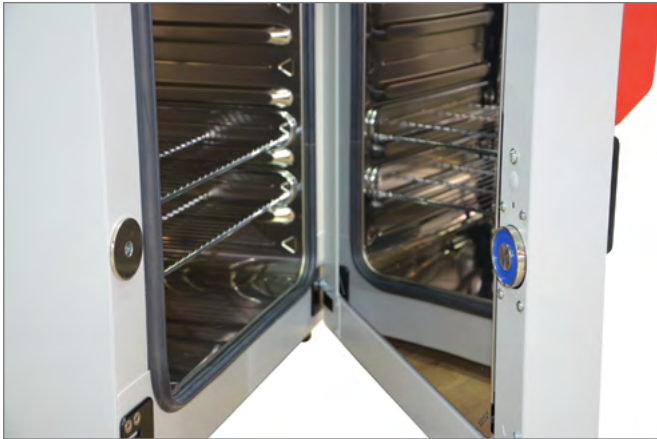
FD 53 model