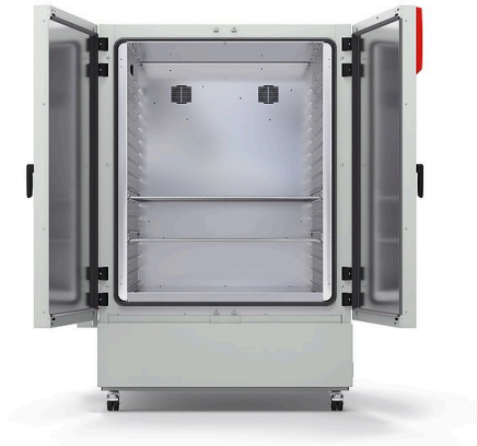
Model KBF-S ECO 1020