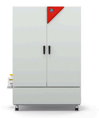
Model KBF-S ECO 1020