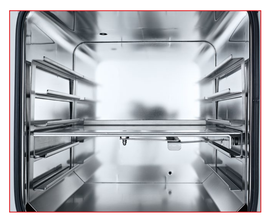
Chrome-plated racks will enable you to dry test specimens homogeneously on several levels.

What this means for you is that first of all you need to consider the size of the test specimen or items to be dried before purchasing your vacuum drying oven. The dimensions of your vacuum drying Oven are of crucial importance and will depend on your requirements.