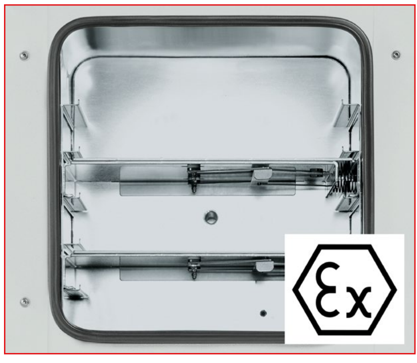
Important Safety Features: Inert gas connection for interior oven flushing. Electronic components are completely separate from interior oven

Safety is guaranteed by the VDL vacuum drying ovens for flammable solvents first and foremost by their explosion-proof interior. Adjustment without overshooting also provides maximum protection for samples, while a unique safety concept is in place where operation is concerned. The design and innovative equipment comply with ATEX II 3G standards.