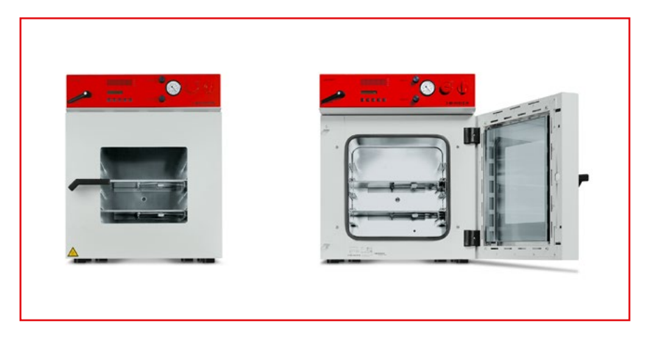
The VD and VDL series from BINDER are suitable for non-flammable materials and materials containing flammable solvents, and they feature a unique safety concept.

We have put together this Buyer's Guide to help you maintain a broad overview while considering all the many different applications. We start by explaining how vacuum drying Ovens work in general and then take a look at the key properties a decent unit will possess, so you know exactly which details you should be looking out for when making your own choice.