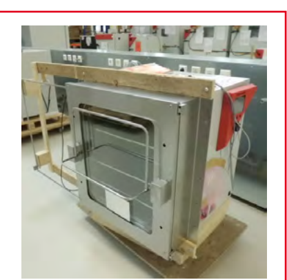
> 2. Modified CB 160 incubator

Customer contact: Sysmex Suisse AG Tödistrasse 50 CH-8810 Horgen