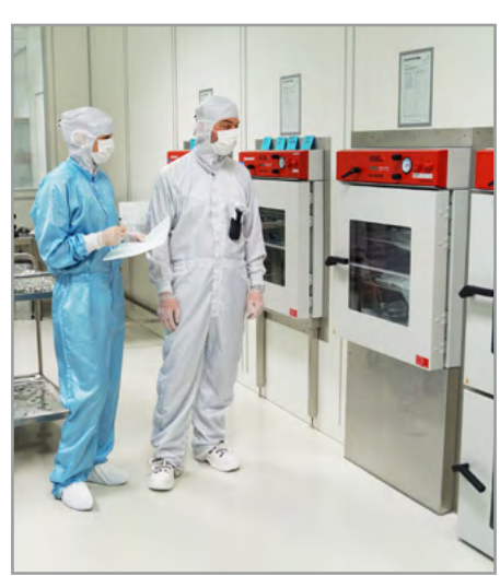
> The vacuum drying chambers from BINDER are used at GEWO to dry components that are used for the production of processors.

Among these products are clever mechanical assemblies used in the semiconductor