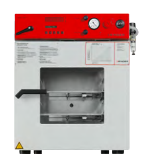
> VDL 53 model