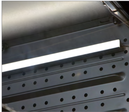
30 cm light bars, fastened to the side of the chamber with tesa Powerstrips®