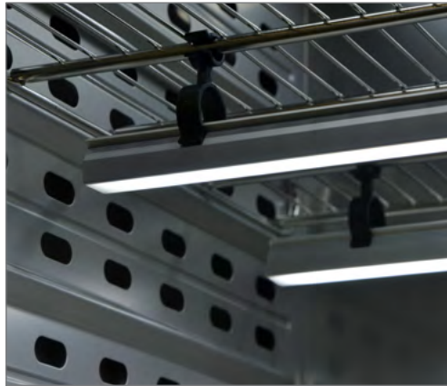
50 cm light bars, fastened to the rack with plastic clips