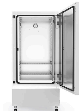
Model KB-ECO 400