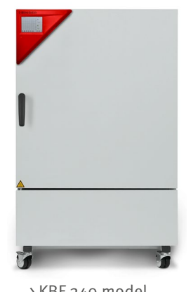
> KBF 240 model