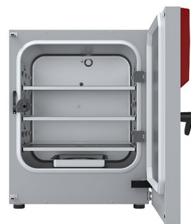
Model CB 170