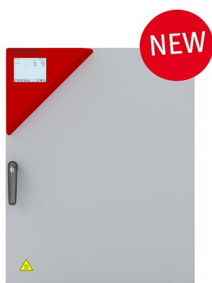
Model CB 170