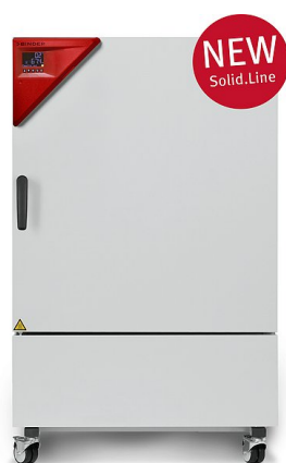
Model KBF-S 240