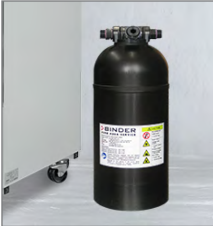
BINDER PURE AQUA SERVICE