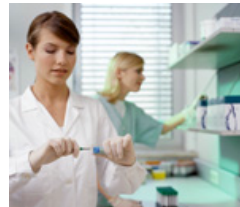
Clinics / University Hospitals