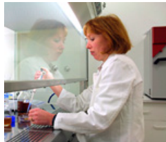
Basic Research / Research Institutes