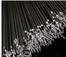
Metal Industry / Engineering