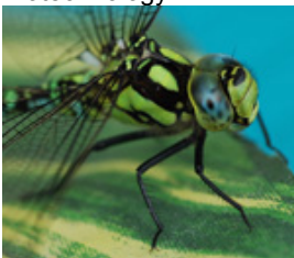
Plant / Insect Growth