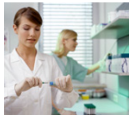
Clinics / University Hospitals