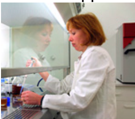
Basic Research / Research Institutes